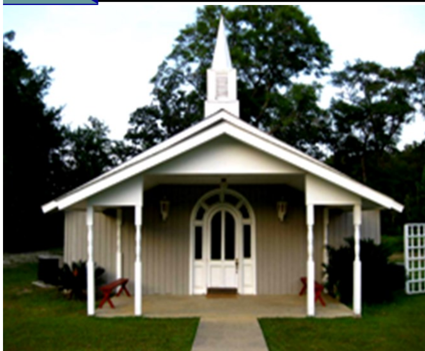
CHAPEL AT CAMP JACKSON